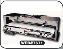
KTRON SODER SWB-300-N Weigh Belt Feeder 20 - 20,000 kg/hr