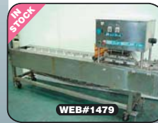
SG Tray Sealer, Approx 20 cycles/minute