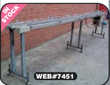
SPRINTER (PVC) Belt Conveyor 150mm W x 4000mm L