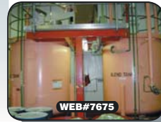
Chocolate Tank (m/s, jacketed, with stirrer) 5000L 2 available