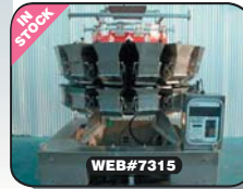
ISHIDA Multihed Weigher (14 Head) 500-5000g - up to 70/min