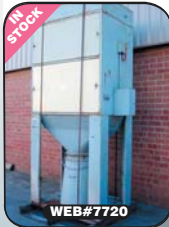
DCE VOKES UMA 254 G3 Dust Extractor .2HP