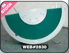
TRANSNORM System 180 Degree Conveyor Bend