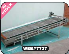
N/A Mesh Cooling Belt (s/s) 1200mm x 4200mm