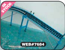
45 Deg and Straight Inclined Gravity Roller