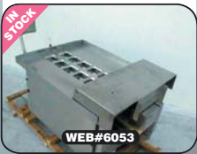
YAMATO 14 Head Linear combination scale Dataweigh SDW-323WH2