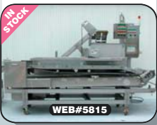
ASAHI SOSETSU (HI-COOK) Breading/Crumbling Machine