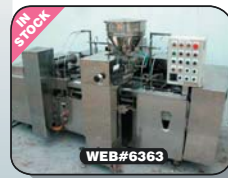
MASDAC Waffle Maker/ Oven