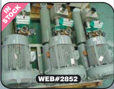
FUJI Treble Pneumatic Blowing System 8.5 mtr cub/min each