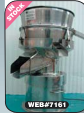
Single Deck s/s Vibratory Screen 400mm diameter