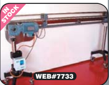
FLEXLINK Conveyor Belt (brand new, mobile) 85mm W x 2400mm L