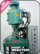
TOHO SANGYO Vacuum Can Seamer (single head)