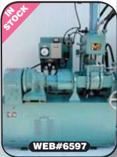
MORIYAMA Lab s/s Mixer/Extruder:3 - 8L. Vac jacketed