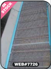
Mesh cooling belt (s/s) 600mm W x 6000mm L