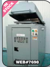
TOYO RICE MACHINERY Vacuum Packer (used on 5kg rice)