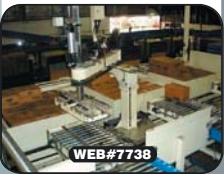
Automatic 6 Lane Robotic Palletising Line, 40+ cases/ min