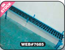
Gravity Roller 450mm W x 3,000mm L