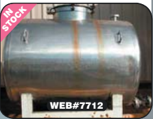
Stainless Steel Storage Tank 1000L, 3 available