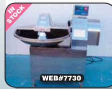
OHMACHI SANGYO Silent Cutter 40L (S/S)