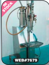
MASTERFIL Piston Filler (Semi Auto) 5L