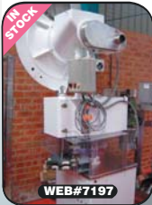
INIL Screw Capper (Pick and place)